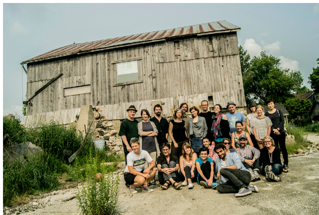
Fig. 6. Participants and staff at the Film Farm, 2015

As such, the Film Farm's films can be described as a remarkable antidote to the drive for an ever more spectacular and dispersed view of the world as previously seen in Life in a Day . Simultaneously, the Film Farm's films give a highly personal insight into the lives of the makers, often radically revealing their divergent sexuality, political orientation and/or artistic otherness. The Film Farm's films are mostly screened within an experimental film context and the distribution method is similar to the one used by the makers of I Love You . The filmmakers will often travel around with their work, screening selections of shorts in dedicated venues, while afterwards engaging in discussion with the audience. Although this has a limited reach, the unique quality and content of the films can be fully appreciated and understood in such a context. Spectators are often involved in filmmaking in some capacity: as directors, artists, teachers or critical thinkers. This specialised audience has a sensibility to the phenomenological experience that these films have to offer.