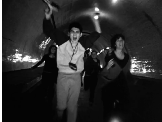
Fig. 5. Screenshot from the opening sequence of The Sound we See: A Los Angeles City Symphony by Echo Park Film Center.

The Sound we See: A Los Angeles City Symphony is a 'glocal' version of Life in a Day , much more aware of the tensions and contradictions of contemporary city life than its high-end counterpart. The community aspect of the project is taken a lot more seriously as well, besides filming the actual footage, participants did their own editing and also had a say in further post-production decisions. All of this successfully holds together, supported by the 24-hour grid and the continuous guidance and support of the project leaders who run their centre (and externally affiliated groups) as a big family.