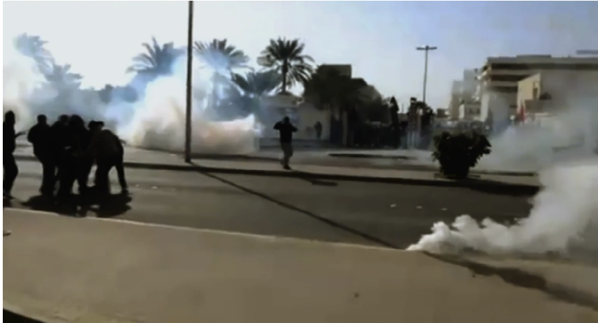
Fig. 1. Screenshot from The Uprising by Peter Snowden.