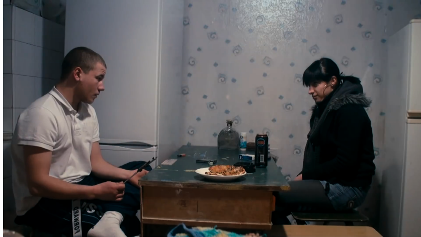
Fig.3. Screenshot from I Love You (Я Тебя Люблю) by Aleksander Rastorguev and Pavel Kostomarov.

Similarly to The Uprising , the documentary I Love You focuses on strong emotional experiences which are represented in unpolished footage. The participants also struggle, but their situation is not as life threatening as the situation in the Arab World. The film had limited success in the international festival circuit, it was mainly produced with a domestic audience in mind: “For months they’ve toured Russia and Ukraine, appearing in-person at multiple screenings, conducting discussion panels and engaging with the audience” (ibid.). This form of independent, self-organised distribution is significant and important in regard to the effectiveness of the film’s prefigurative elements. Screening the film in the specific cultural context in which it was conceived will make the participatory elements much more effective. Gestures and subtle cultural codes will be understood almost effortlessly, encouraging the audience to analyse and discuss the film with their peers.