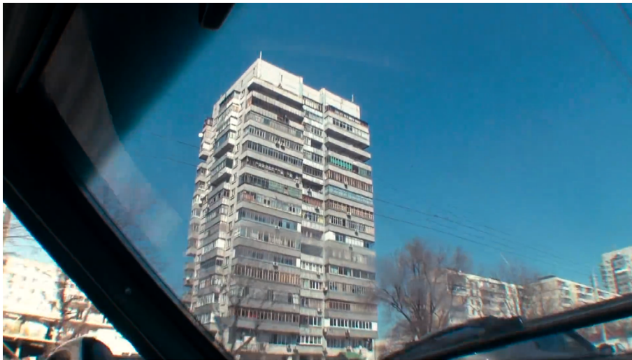
Fig. 2. Screenshot from I Love You (Я Тебя Люблю) by Aleksander Rastorguev and Pavel Kostomarov.

In I Love You we are confronted with a small army of disenfranchised workers looking for love and comfort in the new reality of rogue capitalism that has replaced the now deflated utopia of Soviet communism. Again, the main weapon of the cinematic soldiers is a camera, a digital machine that can accurately 'shoot' visual information. The absence of the communal is palpable, and is embodied by the toiling, swearing and drinking of the main characters. If we can talk about poetics here, the directors deserve credit for achieving a balance between their forfeiture of control during the shooting and their recoupment during the editing phase, rhyming the crude footage into a refined whole. The film's ethics are also precarious, teetering on the voyeuristic, with its display of intimate imagery of the protagonists' relationships. But the directors succeed in respecting their characters all the way through. The film embraces a so-called 'Youtube' aesthetics that will offend some cinephiles but can be seen as affectionate to the concurrent moving image apparatus, the digital Kino-Eye. As such the film comes much closer to Manovich's desired maturation of the database as a narrative tool. However, the key decisions in the filmmaking process are dependent on the directors, as substantiated by them in the already mentioned interview: "We have given them an opportunity to begin talking and then took their syntagms and assembled a coherent text" (ibid.).