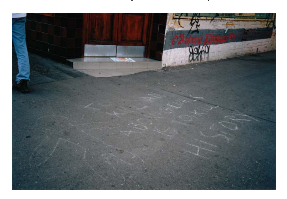
Figure 8: To kill an Aboriginal is to kill history, King Street, Newtown, NSW.

A different kind of graffiti memorial, but with similar political intent, was chalked on Newtown's shopping strip after teenager TJ Hickey died. A few kilometres away TJ had been impaled on a fence as a police car followed his bicycle. A protest riot broke out in Redfern, a largely Aboriginal suburb, and body outlines were drawn on Newtown footpaths, where local social activists would see them. Slogans written beside the body shapes read "Stop racist police brutality ... Cops kill children ... To kill an Aboriginal is to kill history". <sup>20</sup>