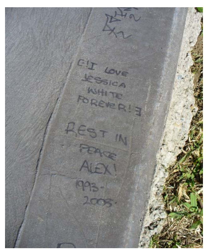
Figure 1: Rest in peace Alex!, Macarthur, NSW, near the railway station.

I am visiting a colleague who works at Macarthur, on the south-western fringes of Sydney. At lunchtime we go for a walk. The landscape here is undulating and a grey concrete path links the university and the technical institute to the railway station. It curves across a wide, grassy recreation area that was once agricultural land established in the early days of the colony. Near the top of the rise – where the path becomes a footbridge over both the railway line and a creek-bed overgrown with saplings and bent shopping trolleys – neat inscriptions in black felt-tipped pen decorate the edges of the concrete. Alongside various jokes and romantic messages there are some dedicated to "Alex 1993-2008": "Rest in Peace ... Your our angel ... I miss u so much babe!".