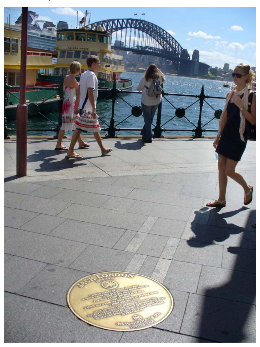
Figure 3: Jack London ... I would rather be ashes than dust , Writers Walk, Circular Quay, Sydney, NSW.

But there are also regrets for the loss of some imagined innocence of spirit from the early days and, not coincidentally, latter-day expressions of remorse for the treatment of Indigenous people: "Sydney ... was populated by leisured multitudes all in their short-sleeves and all picnicking all the day ..." I am born of the conquerors, you of the persecuted ..." Until a treaty is agreed with the original inhabitants, I shall be homeless in the world".