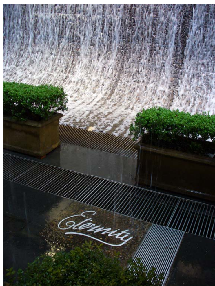
Figure 6: Eternity , Town Hall Square, Sydney, NSW.

It is significant that this city should have adopted as its motto the one-word sermon of an eccentric evangelist who chalked his message on its footpaths for 30 years. That iconic word, "Eternity", flashed on the Harbour Bridge in 2000 Olympic works displays, and now preserved in stainless steel on the pavement of Town Hall Square, offers the hope of redemption but only by calling attention to the certainty of death. 17