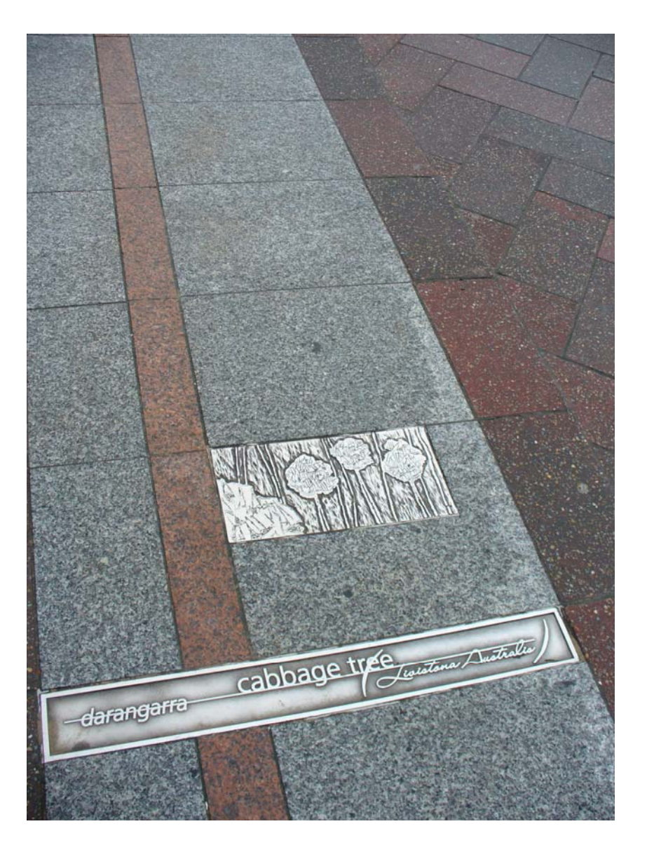
Figure 5: darangarra ... cabbage tree, part of the Shell installation, Manly Wharf, NSW.

There is a comparable sculpture across the harbour at Manly Wharf, where the ferries from Circular Quay arrive. Radially arranged stainless steel plaques introduce seaside holiday-makers to Manly's municipal self-image, with references to decommissioned ferries and dead historical figures. In a section of the sculpture that depicts now marginalised or invisible flora and fauna – the latter including "local clans (1788)" – rock-art motifs have once again been appropriated for public art. And once again, these "Aboriginal" pictures are accompanied by nouns salvaged from the debris of European contact.