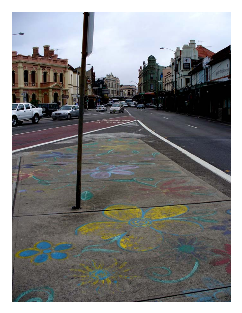
Figure 9: Flowers, King Street, Newtown, NSW.

Death notices and spontaneous shrines appear on the ground in other parts of the city. <sup>23</sup> If I have not written about them here it is because I have not yet found out their background stories. But it is clear that when mourners use the pavement to publicize their grief it is not simply because asphalt is a conveniently blank slate to scribble on. They choose the pavement for their graffiti because of its active role in the fatality or its aftermath. It is the site of that very public death (a city street, a suburban footpath); it is the conveyance that bore the vehicles involved (the cars, the bicycle, the police vehicles); it is the footway where members of a particular audience will pass by (the legal workers, the activists and