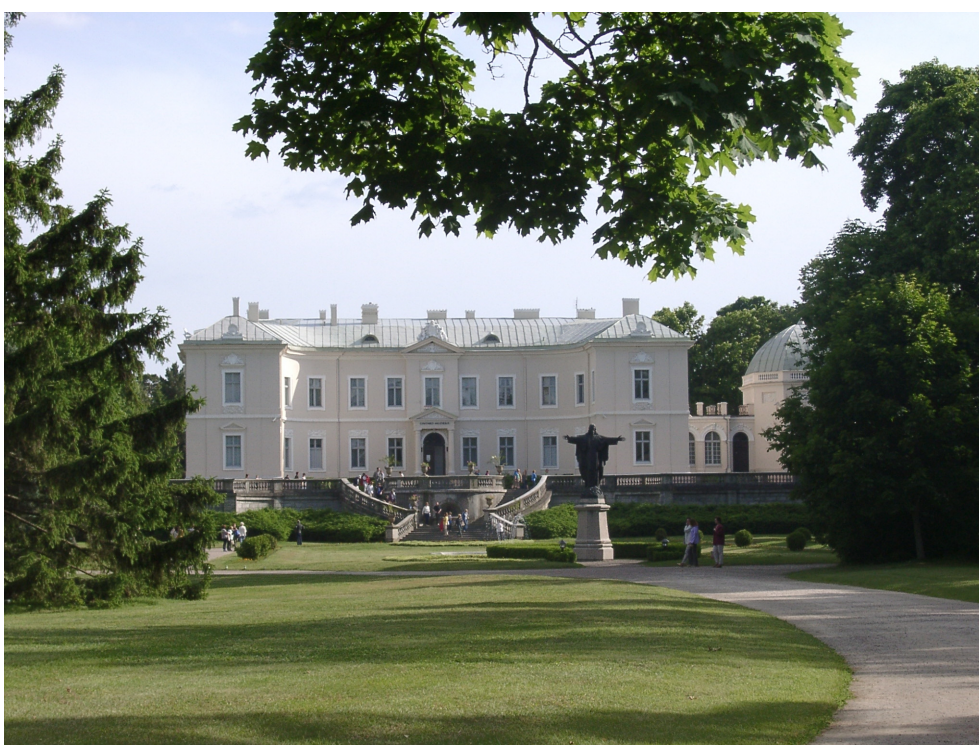
The Museum of Amber, Palanga.