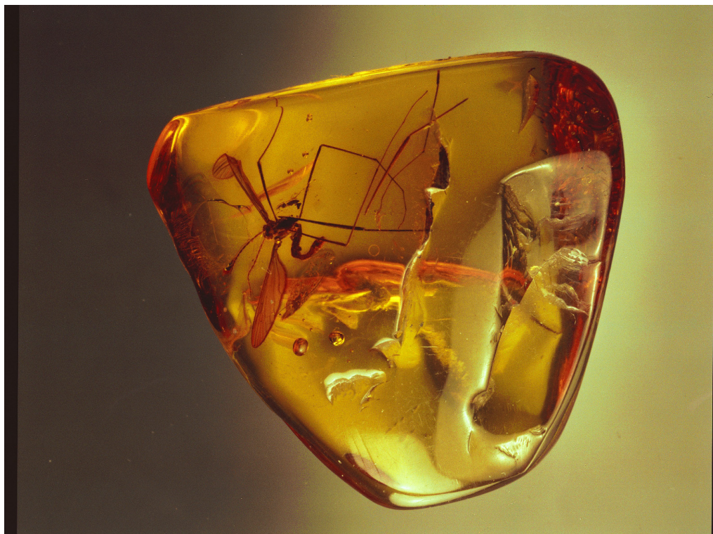
Baltic Amber, ca 50 million years old.