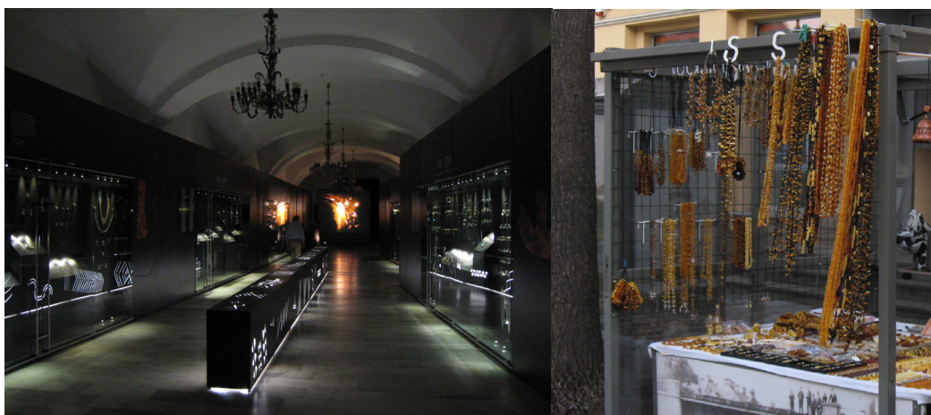
The exhibition Art of the Balts , Vilnius, 2009. © Photo: Eglė Rindzevičiūtė An amber jewellery stall in Vilnius Old Town, 2010. © Photo: Eglė Rindzevičiūtė

fied. The Art of the Balts constructed amber not as a universal marker of all Lithuanians, but as a marker of a particular social group, the military and social elite. As the exhibition architecture brought to mind a high-fashion store, it can be suggested that the organizers wanted to remove amber from the banal context of the everyday life of Lithuanians, who use amber as inexpensive jewellery. Instead, the exhibition framed amber as a genuine Northern gold: a valuable stone which hints at luxury and an item of refined aesthetic contemplation.