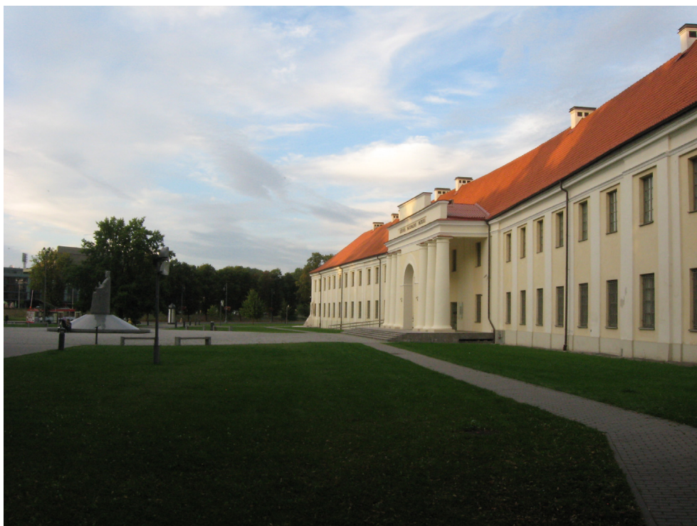
The Lithuanian National Museum, Vilnius.