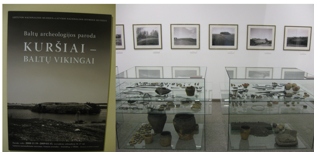
A poster and an exhibition Curonians, Vikings of the Balts , Vilnius, 2008.

From 1992, after achieving independence from the Soviet Union, HEM was re-named the National Museum of Lithuania (LNM). Shortly before the millennium celebration of the name (and perhaps the state) of Lithuania, the LNM arranged an exhibition about Baltic archaeology entitled Curonians: the Vikings of the Balts ( Kuršiai – Baltų vikingai , Vilnius, 19 November 2008-15 March 2009). 15 The curators sought to “inscribe the Baltic tribes on a map of civilizations, on which the territories inhabited by the ancient Balts are not yet marked” (“Britų...” 2009). The exhibition Curonians perpetuated the notion of the Balts as a people whose identity was uncontested and strongly supported by material evidence. The historical presence of the Balts was not to be doubted, but highlighted. The Balts were not presented as “rough barbarians” or people without history who lived at the impassable, swampy and forested edge of Europe, but as a tribe able to produce “jewellery, which demonstrates wealth, power, a great sense of aesthetics” and their weapons revealed their “military force and power” (“Pristatoma...” 2008).