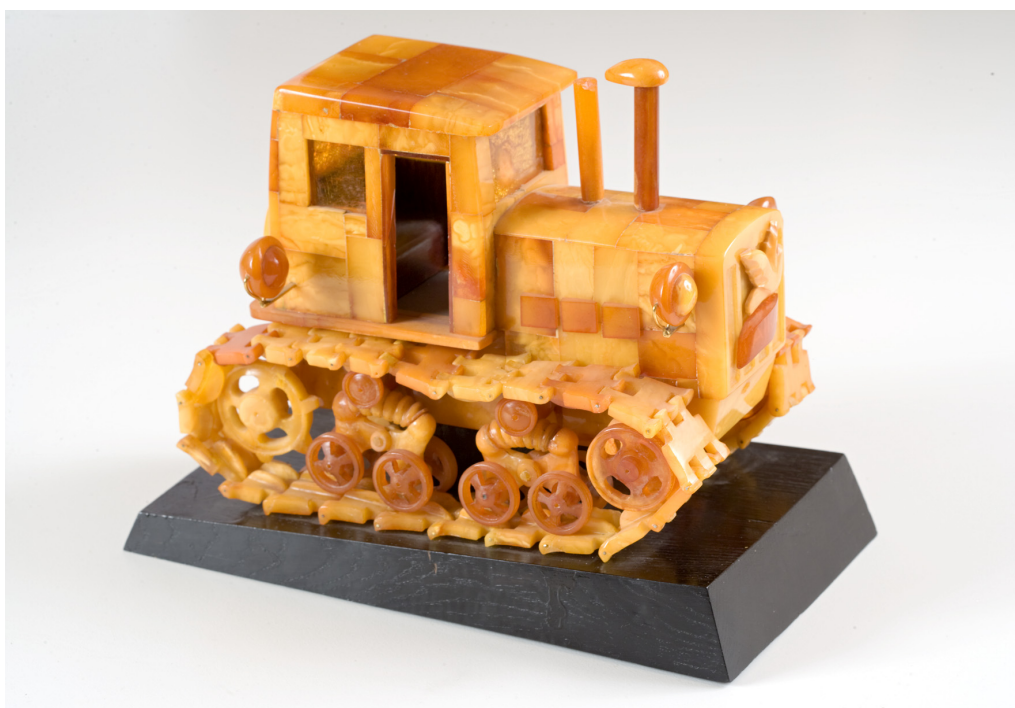
“Tractor” by Mečislovas Sirukevičius. Amber, wood, metal, 16 x 20 cm. Obtained by the Museum of Amber in 1969.