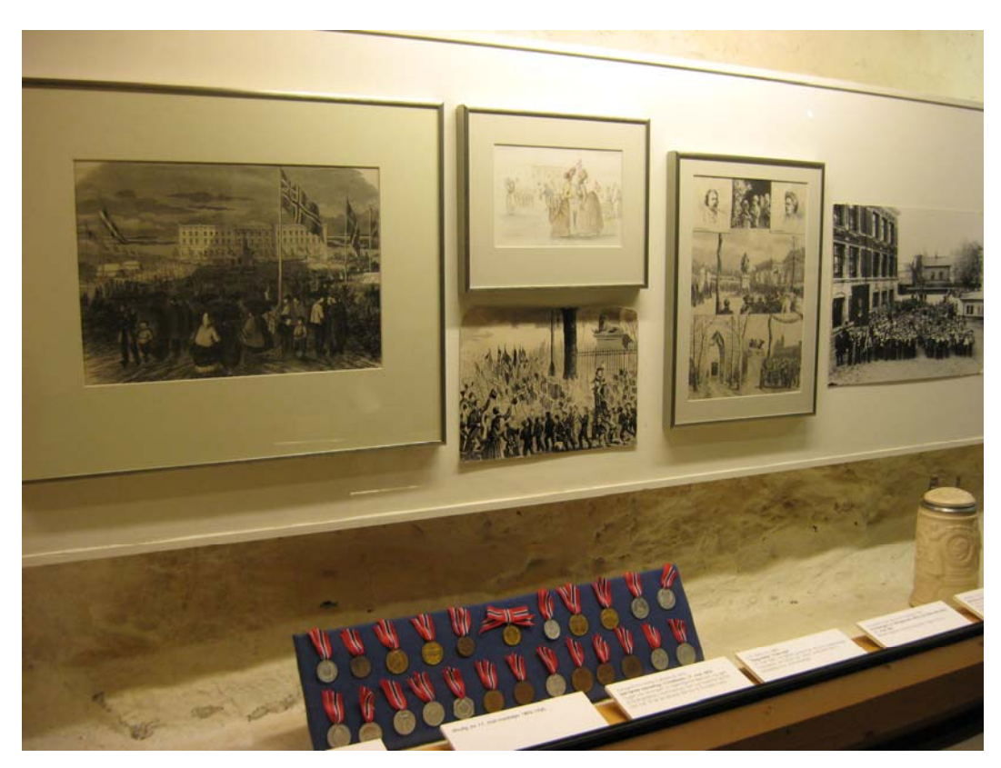
Celebrating Norwegian national independence and its heroes at the Museum of the City of Oslo.

National independence is itself a cherished national value – in part instantiated by Norway's reluctance to join supra-national organizations such as the EU. This can be better appreciated at the light of the interpretation of the successive unions with Denmark and Sweden as colonization, and the trauma of WWII, leading to the invasion of Norway by the Nazi army. These events left an imprint on national consciousness to the effect that national independence is perceived as something that needs to be protected. The projected moral integrity of Norway is also the result of museum narratives emphasizing the fact that Norway was not a colonial power, but rather a victim of Danish and Swedish imperialism (this can be seen for instance at the Mainhaugen Museum, the Oslo City Museum and the Norwegian Museum of Cultural History). This image is being maintained and reactualized at the Nobel Peace Center, extolling the key role of Norway as mediator in international peace negotiations and in international cooperation and development aid. As a corollary, the annual endowment of the Nobel Peace Price by the King of Norway contributes to update Norway's moral authority and international status of a "righteous" nation.