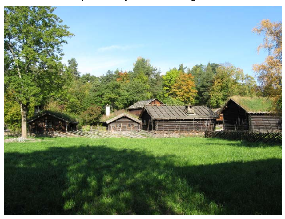
The Romantic, rural past displayed at the Norwegian Museum of Cultural History, Oslo.

Nationalist narratives in Norway develop around a set of values and concepts that can be loosely identified with the notion of folk. These values find an ideal manifestation at the Maihaugen open air Museum and the Norwegian Museum of Cultural History, where the Norwegian nation is displayed in its popular, peasant dimensions. The emphasis on the folk was the result of the 19<sup>th</sup> century Romantic interpretation of national identity framing the peasant as the primordial, authentic and uncorrupted essence of the nation (Stoklund 2003: 23ff). The folk culture approach in the Maihaugen open air Museum and the Norwegian Museum of Cultural History is translated through an emphasis on rural and peasant life, with its corollary of wholesome food, open air activities, and communion with the natural environment – all pervaded by a hint of nostalgia.