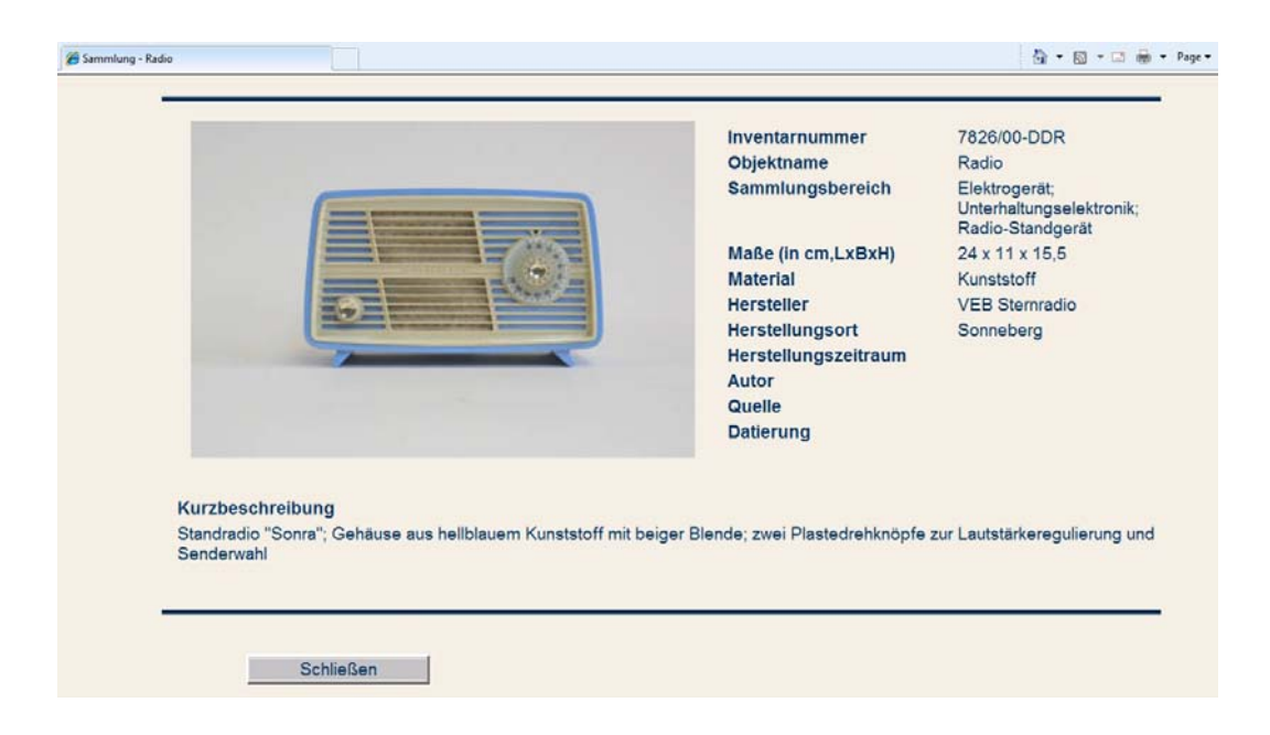
Figure 3: Table-top Radio 'Sonra', Dokumentationszentrum Alltagskultur der DDR http://www.museumsmedien.de/dok/sam/objekt_slg2.php?ido=155