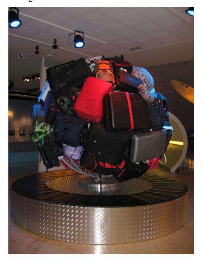
Destination X, Museum of World Cultures, Gothenburg