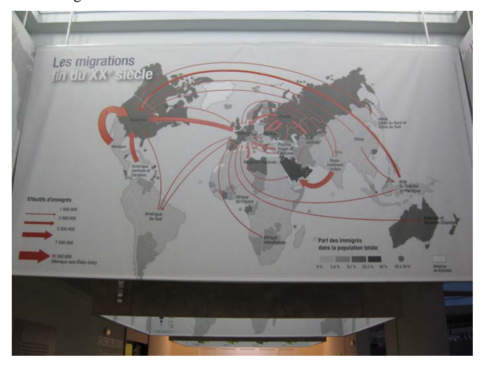
CNHI, Paris

At the Cité National de l'histoire de l'immigration (CNHI) in Paris, so far the only national museum on migration within Europe, the visitor is confronted with maps even before entering the exhibition. The maps here depict migratory routes and flows throughout the two centuries.