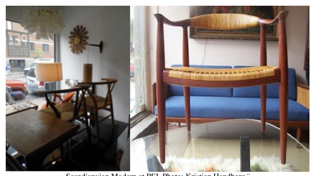
Scandianvian Modern at PEI. " Hans J. Wegner chair sold for 1750 $ at Mtl Modern in rue Amherst.

A similar supply is found in PEI Mobilier Moderne 20e Siécle just around the corner, which was also started by a young retro design collector. The shop is set up in a carefully restored workshop with brick walls and a concrete floor. Antiques and Curiosa, which opened 12 years ago, presents a wide selection of teak furniture on its floor and a complimentary selection of lamps hanging from its ceiling. Its owner confirms the interest in Danish Modern, and he is able to show original 1960s brochures from several Danish manufacturers. Next door, Cite Déco was among the first in the street, opening 20 years ago. It presents a smaller selection of pieces accompanied by artworks from the same period. According to its presentation, Cité Déco offers "vintage furniture from the 20s to the 80s": a period that frames popular modernism with an emphasis on mid-century Modern. Contrary to the cave-like darkness and colored lights in the St.Laurent shops, these shops are bright and spacious, creating a more exclusive focus on the objects.