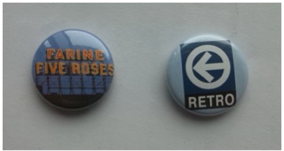
Badges from Montrealité, Boulevard St. Laurent.

A different presence of local symbols in a retro discourse becomes evident in the neighbouring design boutique Montrealité. It offers a selection of clothing, bags, and badges with motifs of modern Montreal icons, such as the Farine Five Roses sign (from the abandoned but still iconic flour factory of that name by Montreal's harbour), the Place Ville-Marie skyscraper, the Habitat 67 and Buckminster-Fuller's American pavilion from Expo 67. Another design is the downward-pointing arrow logo of the Montreal metro turned 90 degrees to the left, now pointing backwards with 'Metro' changed to 'Retro'! Montrealité is run by five designers who started out by selling these things in other shops and at fairs but due to a great demand, they have now been able to open this shop. The newly produced objects here are of course not old, authentic objects like in the neighbouring shops. Whereas these offer pieces from the actual past, Montrealité constructs idealized retro: what the past cannot actually offer. The badges and t-shirts recirculate images and collective memories of Montreal, making them symbols of distinction and a knowing alternative to banal souvenirs or megabrands.