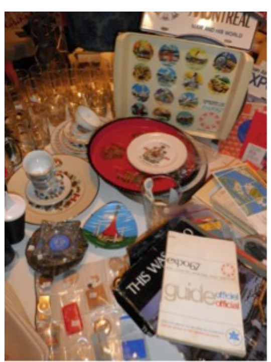
Expo memorabilia at Second Chance, rue Amherst.

The retro shops on Rue Amherst form a distinct cluster. With their aesthetic