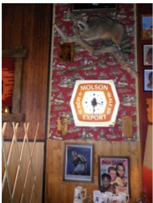
Elvis á la Quebec in fake wood in the Kitsch'n Swell shop.