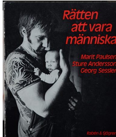
Picture 2 The black and white image on the front cover for the book The right to be human (Paulsen, Sessler & Andersson, 1975), gives a sense of documentary photography; that we are meeting a man in an authentic situation. It is a situation signalling a modern man: the hand holding the child's fragile head and the gaze seeking the baby. Is he seeking a relationship? But it is also an image that clarifies the closeness a child creates, even with a father.

2017b). By not listening to your authentic feelings, there was a risk of creating an alienated Self. It was essential to learn to understand your authentic feelings if you wanted to change this alienating masculinity. This was also the aim of the book: 'The more I understand myself, the less I need to play a role. Nevertheless, I need that protective shell around what is shameful, insecure, or scary' (p. 4). In many ways, this way of reasoning in the debate books had many similarities to the narrative way 'individual crisis' is presented above: it was the individual's responsibility to listen to their inner feelings and take them seriously. Accordingly, one can say that the historical context during the long 1970s seems to be in line with thoughts that were first presented in relation to 'individual crisis' in the late 1960s and early 1970s.