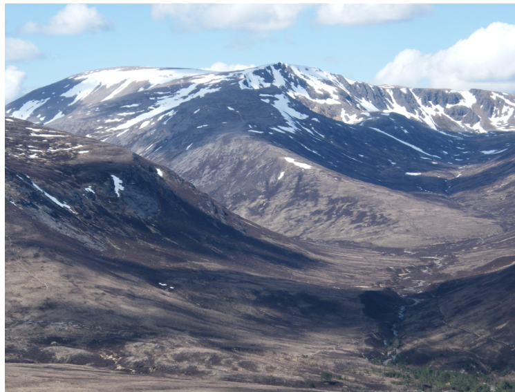
IMAGE 1: Ben Macdui seen from the south.