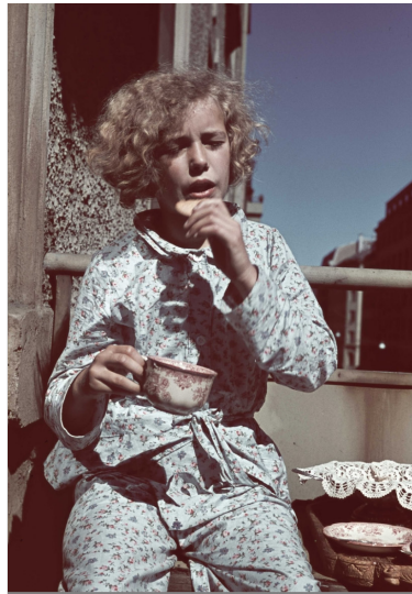
Fig 5. Picture of the balcony at Döbelnsgatan 35.

The second perspective is to establish the centre-periphery in the motifs, to look beyond what the photographer wanted the observer to see, further away from where the sharp part of the image takes the observer (Bringéus 1990). What did he want us to see and what did he consider to be less important, forming a background to the motif? Where, geographically, are the photographs taken? Is it possible to unveil the location? Some of the photos are easy to locate, for example, the city of Copenhagen, outside Tivoli. The girl is smiling, primary school aged, looking away from the photographer; her gaze disappears in the distance. She is holding an ice cream. The sun is shining. It looks like they are on an outing. Perhaps it is the amusement park that is the goal of their trip?