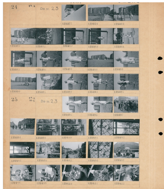
Fig 4. Contact sheet with "Skåne" and then nothing but obviously he is in Copenhagen.

Mapping all the information from the contact sheets about the photographs of the girl made it possible to see when he met her and the number of photos he took of her. This was difficult since the information is scarce. Overall, the only information that could be found was the year the photographs were taken. In general, this is not surprising. Our photographer was not particularly generous with information about the different photographs. What can be expected when going through the contact sheets is the year and, in most cases, where the photographs are taken, but the last is not valid for those he took of the blonde girl. Instead, the surrounding photographs can be used as a clue to where he was located, at least approximately. Looking at those taken before the ones with the blonde girl and those he shot after will in some cases give some useful information. Mostly, he seems to meet the girl in Denmark, or in the south of Sweden. In some cases she seems to be in Stockholm, judging by the surroundings. Nevertheless, it is interesting that there is so much silence around the photos of the girl. The amount of photos of her contradicts this silence and in many cases enhances the silence and makes it louder than in other cases in the contact sheets.