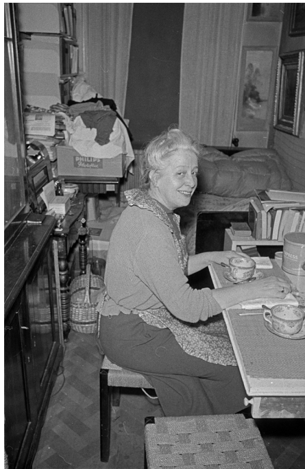
Fig 1. Picture of their home.