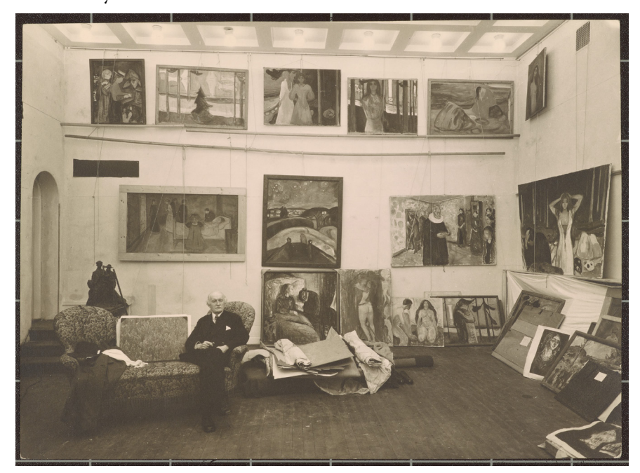
Fig. 6. Edvard Munch in his studio at Ekely on the outskirts of Oslo, ca. 1938.

that the experiential aspects of reproductions were most frequently mentioned by respondents (thirty-five times; see Fig. 7). Furthermore, variants of a Norwegian noun en opplevelse (an experience) and a verb å oppleve (to experience) were mentioned by interviewees about 20 times.