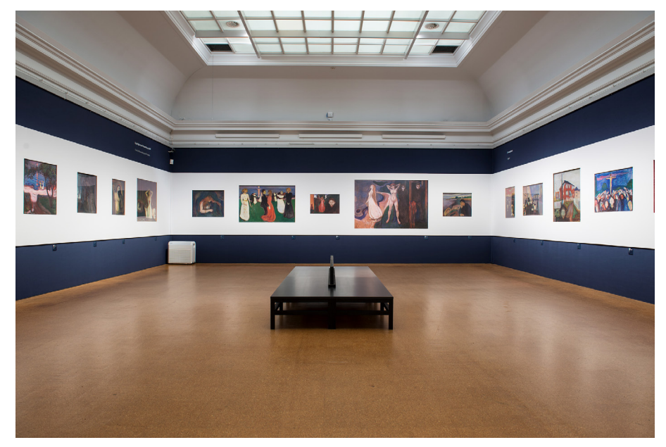
Fig. 1. Edvard Munch's Frieze of Life reconstructed in the Munch room in the National Gallery, Oslo, 2013.

The first case concerns the reconstruction of Edvard Munch's famous picture series, the Frieze of Life , in the Munch Room in the National Gallery in Oslo, which was a part of Munch 150 exhibition.<sup>2</sup> (Fig. 1) The installation of twenty-two paintings was modelled after Edvard Munch's exhibition at the Berlin Secession in 1902, where the artists experimented with the framing of the cycle and hung it high up on the walls around the room.<sup>3</sup> (Fig. 2) Like art historian Wenche Volle points out, the reconstruction "draw[s] attention to the way in which he [Munch] framed the frieze and adapted it to different architectural settings within different art institutions" (2014: 144). The series deals with existential themes, expressed in titles such as Love , Angst and Death (subtitles actually used in 1902 and 2013), and was in 2013 shown in the same manner as 111 years before – the paintings were taken out of their frames and mounted high on the walls, framed only in a beige textile passe-partout.