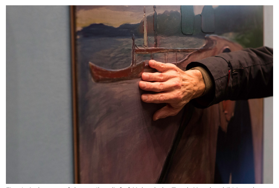
Fig. 4. A close-up of the tactile relief of Melancholy. Touch\ Munch\ exhibition , the Munch Museum, Oslo, 2015.