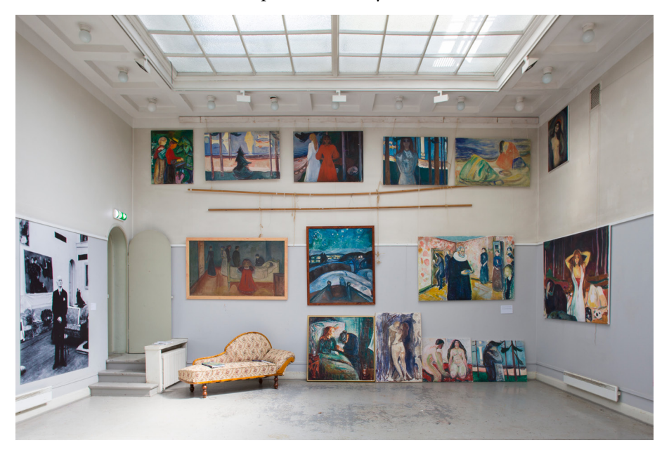
Fig. 5. Edvard Munch's studio wall reconstruction, Ekely, Oslo, 2015.

In addition to the two main cases introduced above, a third one, less-explored by me, serves to provide context. That is the annual summer exhibition produced by the Munch Museum and displayed at the Munch's atelier Ekely,<sup>4</sup> which was the artist's permanent residence on the outskirts of Oslo from 1916 until his death in 1944. The exhibition's core part is the reconstruction of a wall of the artist's studio based on a photograph taken ca. 1938, which depicts Munch himself, posing on the sofa, with three rows of his pictures in the background. In the exhibition, fourteen photoprints are displayed in the same order as the paintings hung on the wall 75 years ago (see Fig. 5 and Fig 6). The documentary exhibition was shown for the first time in 2013 and has been presented every summer since then.