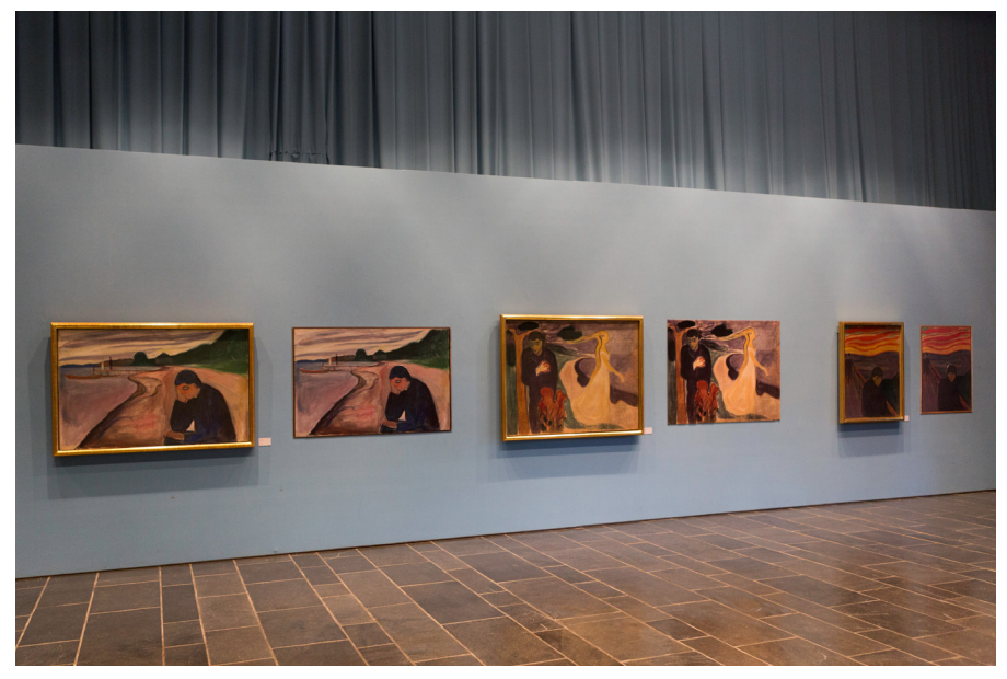
Fig. 3. The \it Touch Munch exhibition, the Munch Museum, Oslo, 2015.