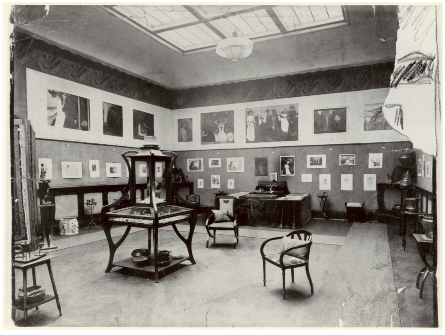
Fig. 2. Edvard Munch's exhibition at Kunsthandlung P.H. Beyer & Sohn, Leipzig, 1903.

The Frieze of Life series can be read as a connected visual narrative (Guleng 2013, Eggum 2000, Volle 2013). The aim of the installation was to present the whole and offer a unique spatial experience, but not all the original paintings could be borrowed. Therefore, in order to build a reconstruction, when setting up the exhibition, the museum had to rely on five coloured photoprints: Dance on the Beach (1899–1900), Jealousy (1895), Woman (1894), Golgotha (1900), and Death and the Child (1899). Reproductions were ordered at a printing house FotoPhono Imaging in Oslo, which is known for engaging in artistic projects.